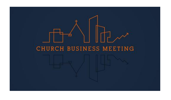
Monthly Business Meeting Sunday, April 22 @ 5:00 pm in the Fellowship Hall